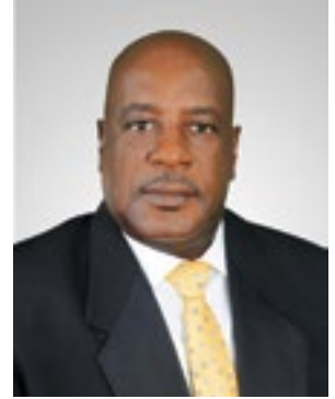
ARLINGTON MUSGROVE ELECTORAL DISTRICT 4 MIDDLE & NORTH CAICOS