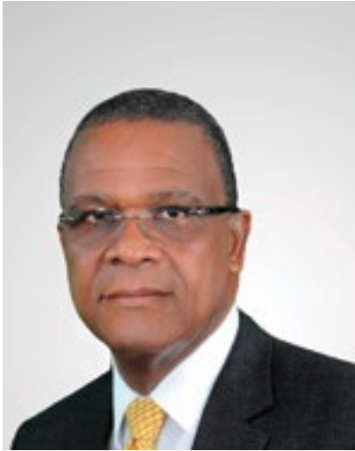
HON. CHARLES WASHINGTON MISICK PNP LEADER