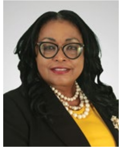
HON. JOSEPHINE CONNOLLY ALL ISLAND CANDIDATE