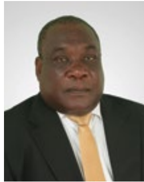
SAMUEL BEEN ELECTORAL DISTRICT 7 CHESHIRE HALL, KEW TOWN & RICHMOND HILLS