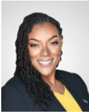
HON. AKIERRA MISSICK ELECTORAL DISTRICT 5 LEEWARD & LONG BAY