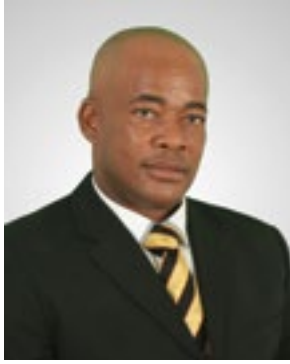
OTIS MORRIS ELECTORAL DISTRICT 1 GRAND TURK NORTH